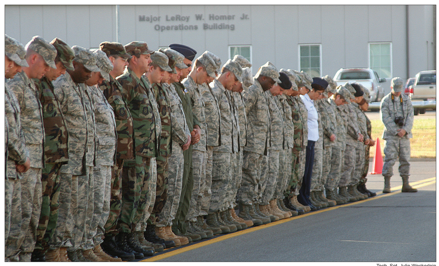
Remembering the Fallen